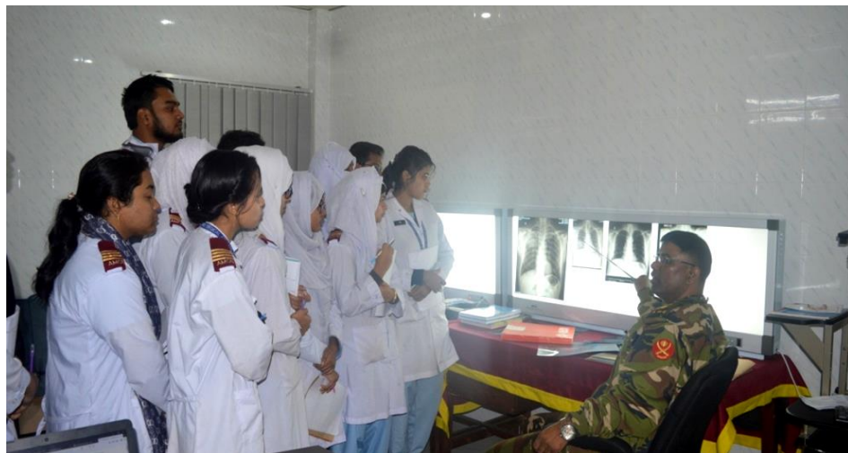
Radiology & Imaging Clinical Teaching

Department of Radiology & Imaging is responsible for teaching the students 5 hours lecture in 5th year and 1 weeks bedside teaching in 3rd year.