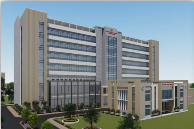
Army Medical College Chattogram