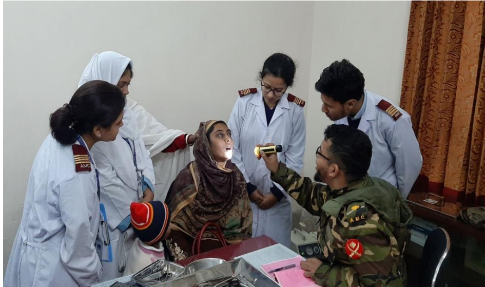
ENT Clinical Teaching

Department of ENT is responsible for teaching the students of 4th and 5th year MBBS course. Total allocation of teaching for the subject is 40 hours lecture and 8 weeks bedside teaching.