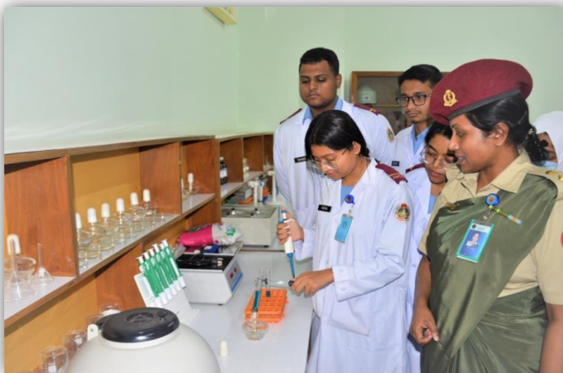
Practical Class in Biochemistry Lab

Department of Biochemistry helps to understand the maintenance of health and effective treatment of diseases. The department is thus organized to teach students about basic knowledge on life process depending upon chemical principles, performing and interpreting biochemical laboratory tests and procedures and requisite knowledge for higher studies and research. The teaching methodology involves theoretical lectures, tutorials and practical demonstrations which include 117 hours for lectures, 100 hours for tutorials and 100 hours for practical classes.