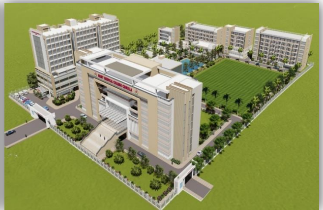
Army Medical College Cumilla