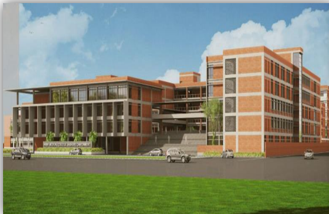
Army Medical College Jashore