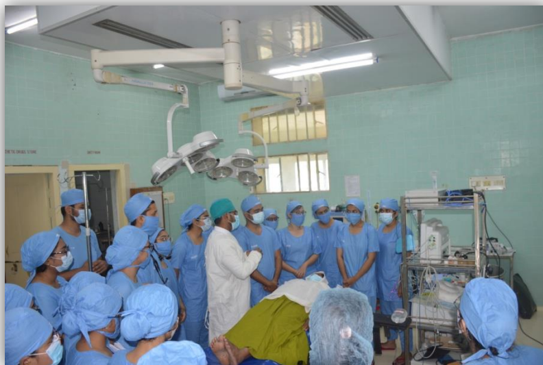
Surgery Clinical Teaching

specialists. The allocation of teaching hours for the subject is 300 hours for theoretical lectures (Basic principles of surgery, Gastro-Intestinal surgery, Urology, Thoracic surgery, Neurosurgery, Cardiovascular surgery, Pediatric surgery, Organ transplantation surgery and the allied specialties-Anaesthesiology, Radiology & Imaging, Blood transfusion, Radiation oncology, Dental surgery, Physical medicine and Rehabilitation) Integrated Teaching Program for 20 hours and 3½ years (200 hours) of clinical practice in the affiliated teaching hospitals as well as the community-catchment areas as per syllabus.