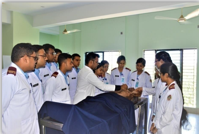
Anatomy Dissection Hall

Department of Anatomy is responsible for teaching pre-clinical cadets. The department teaches various disciplines of Anatomy namely Gross Anatomy, Embryology, Neuro Anatomy, Histology, Radiological Anatomy and Living Anatomy providing special emphasis on general, applied and functional aspects. Three academic terms cater for 527 hours out of which theoretical lecturers cover 115 hours and rest 412 hours are for tutorial, practical, dissection and demonstration classes.